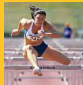
Michelle Jenneke Athletics