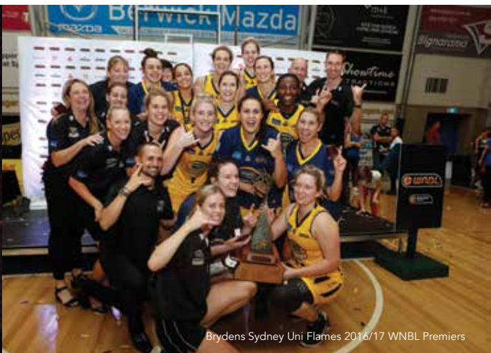
Brydens Sydney Uni Flames 2016/17 WNBL Premiers

To apply for a sporting scholarship/membership to the Elite Athlete Program, please follow the procedures below.