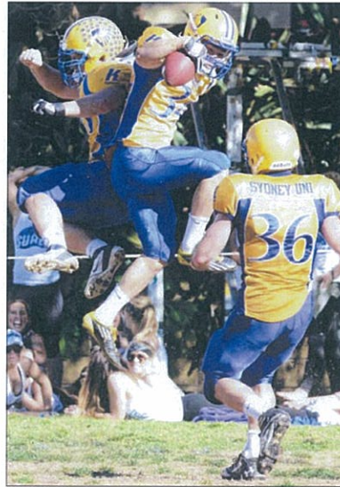
Sydney Uni Lions' players celebrate a touchdown in their 45-13 win over Gold Coast Stingrays.